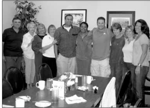
Fall 2008 Roanoke Area Chapter Meeting, Roanoker Restaurant, Roanoke, Virginia

"There exists among us a fellowship, a friendliness, and an understanding which is indescribably wonderful." ~ From the Big Book of Alcoholics Anonymous, First Edition.