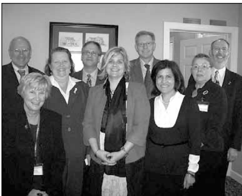
The Royal College of Dental Surgeons & Ontario Dental Association Visit WP/TFC